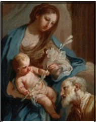
The Madonna Appearing to Saint Philip Neri